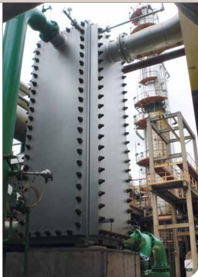
Petrobras' Replan Refinery in São Paulo has installed Alfa Laval Compabloc compact heat exchangers in the sour water stripping unit and the FCC unit.

The first of Replan's eight Compablocs, installed in 2002, operates as a condenser in the sour water stripping column. Equipped with titanium plates, the unit replaced an existing shell-and-tube unit with a tube bundle in AISI 304 which was facing serious corrosion problems. These were primarily due to high contents of chlorides and hydrogen sulphide in the